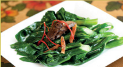
铁脯芥兰 {503} Stir-Fried Kai Lan with Dried Flounder