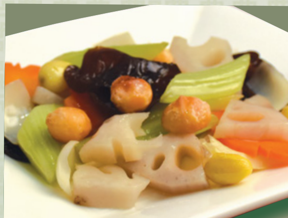
百合芹杏当归汁 $15 Stir-Fried Lily Buds and Celery in Angelica Broth