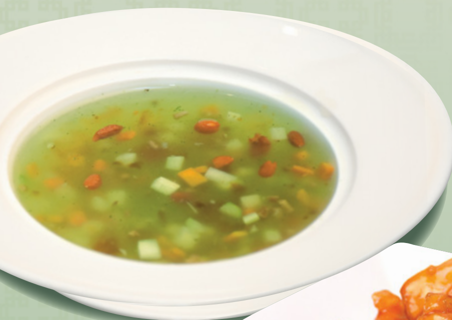
松茸桃胶菠菜羹 $10 Braised Mushroom & Spinach with Peach Collagen Bisque