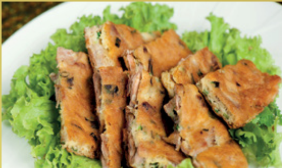
鸭皇蛋 [404] Imperial Fried Egg with Duck Meat