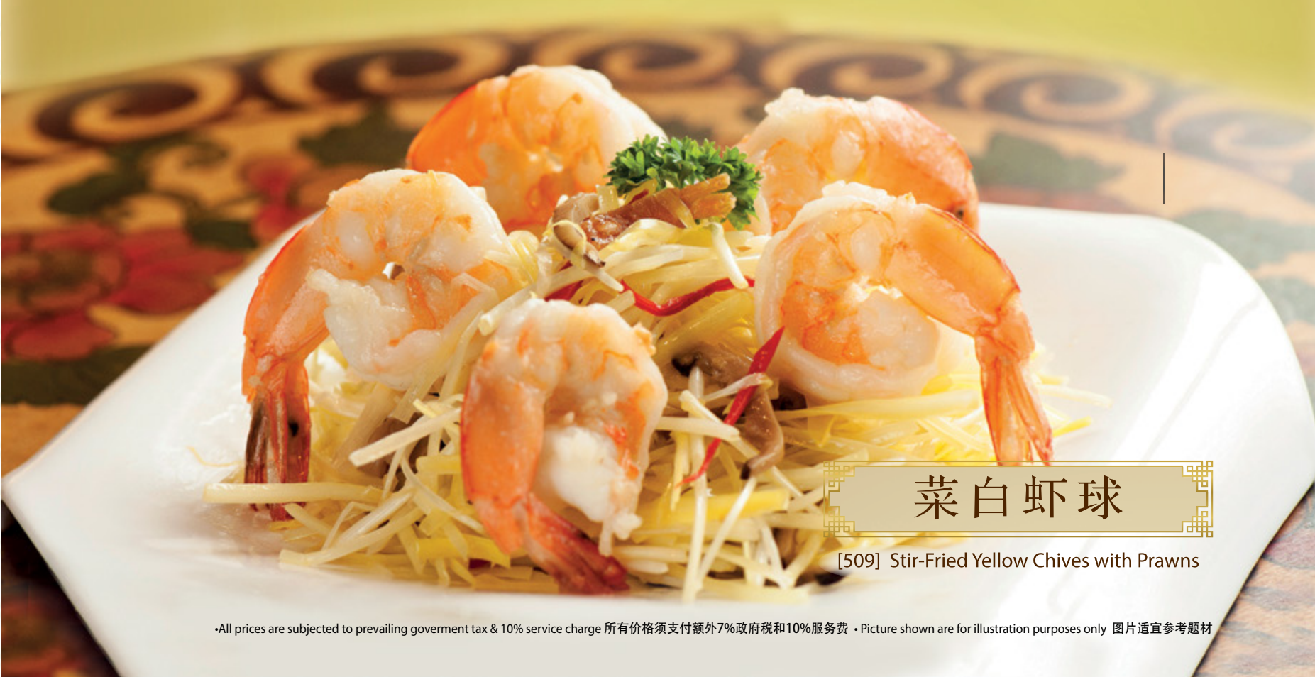
[509] Stir-Fried Yellow Chives with Prawns