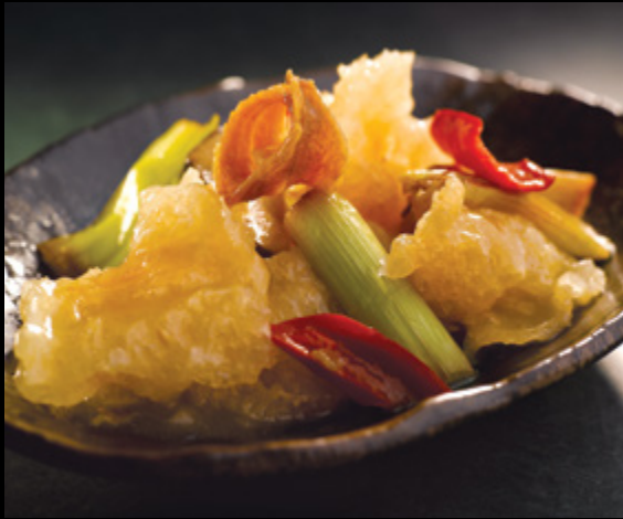
北葱炆鱼鳔 [128] Braised Fish Maw in Teochew Style