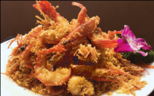
避风塘虾 $22 Sautéed "Bi Feng Tang" Prawns