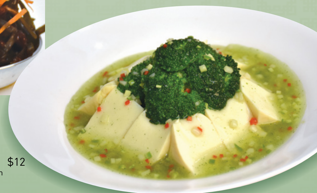
绿园金汁蒸普宁豆干 $12 Steamed “Pu-Ning” Beancurd with Spinach Broth