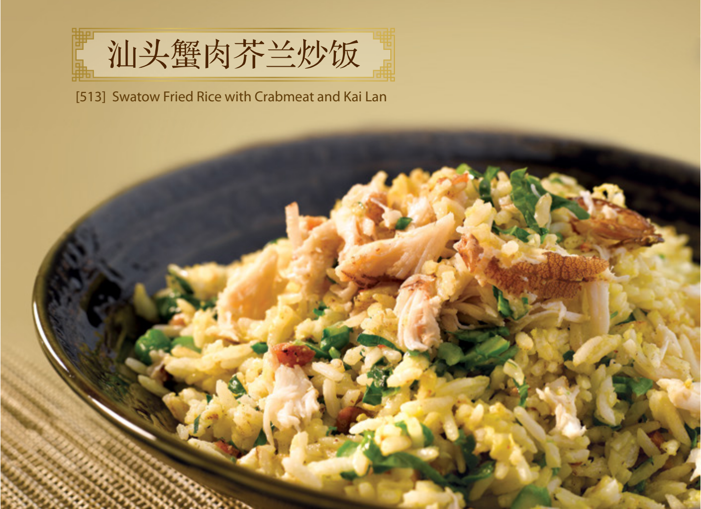
汕头蟹肉芥兰炒饭 [513] Swatow Fried Rice with Crabmeat and Kai Lan