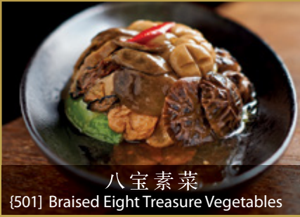
八宝素菜 [501] Braised Eight Treasure Vegetables