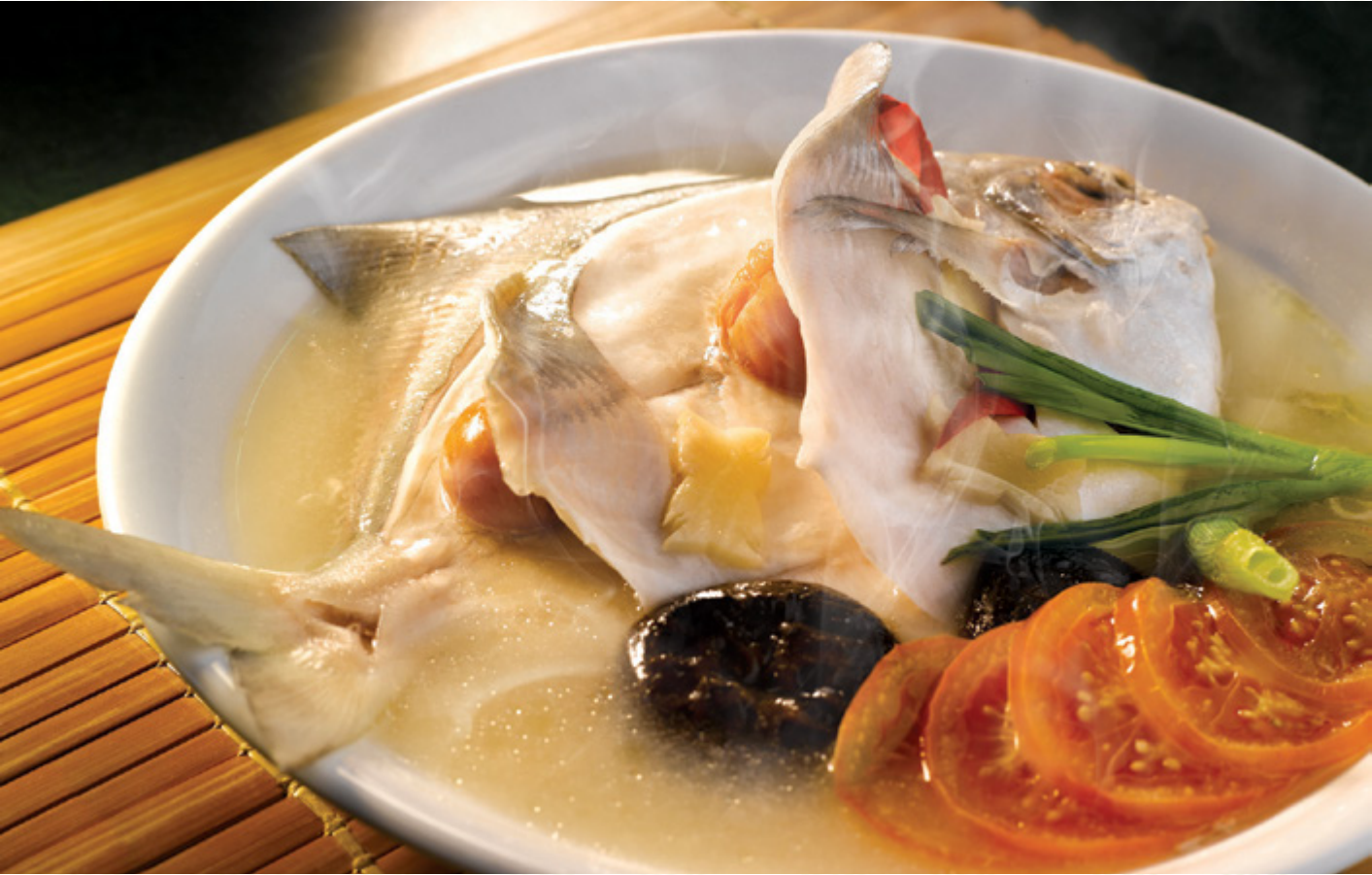
鸳鸯双味鲷 [121] Pomfret in Duo Style