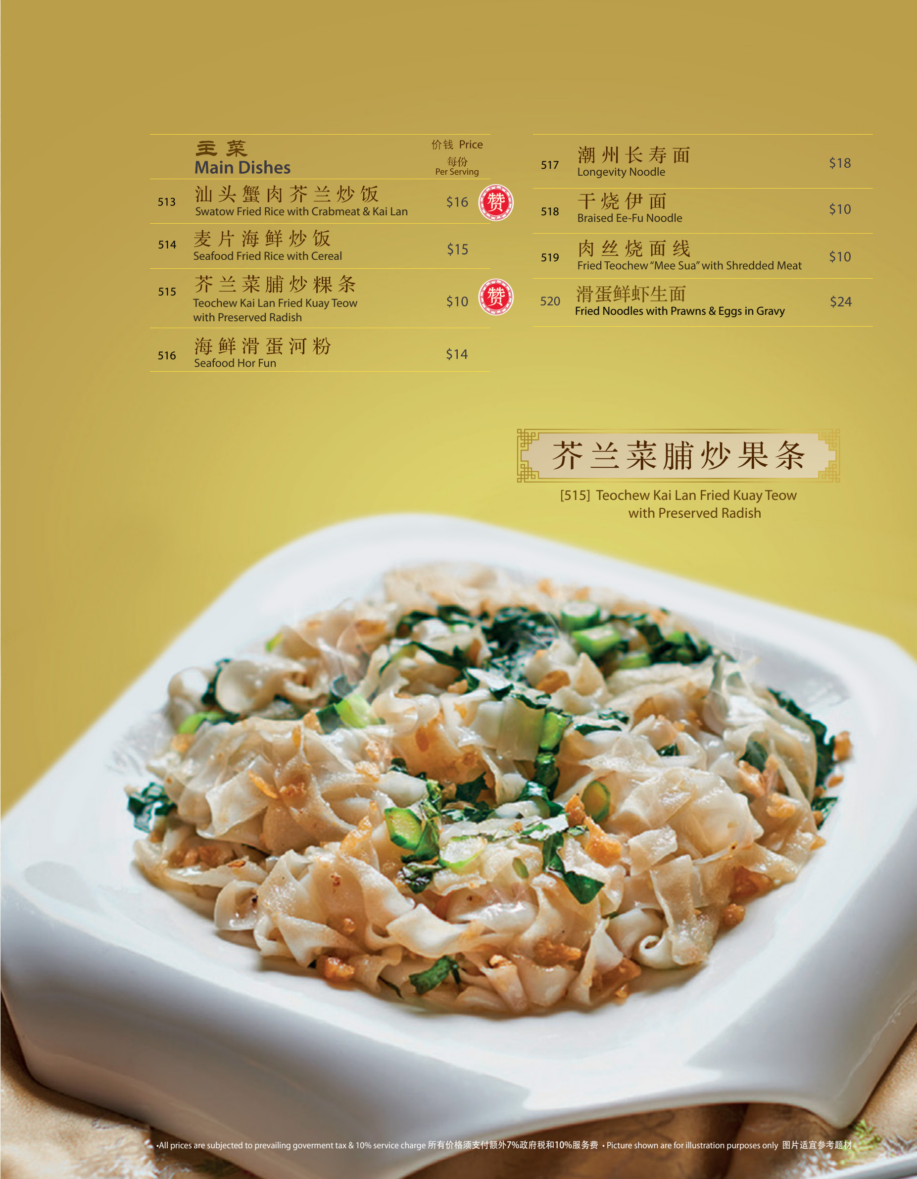
芥兰菜脯炒果条 [515] Teochew Kai Lan Fried Kuay Teow with Preserved Radish