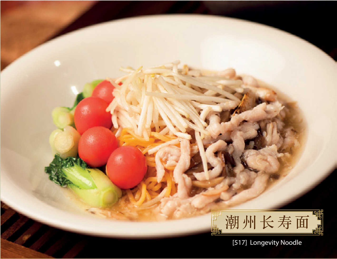
潮州长寿面 [517] Longevity Noodle