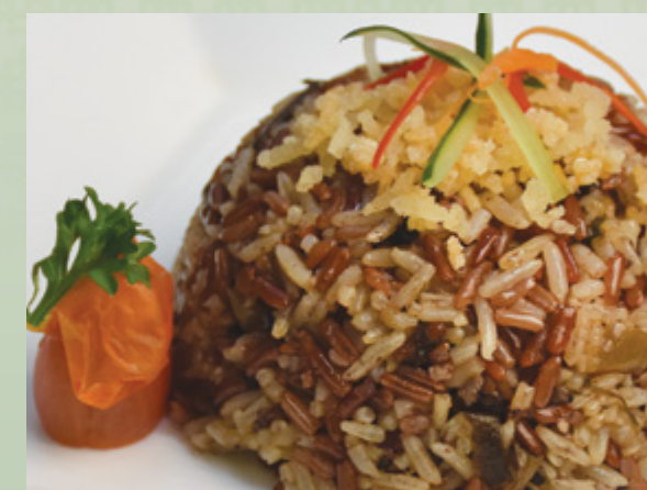
榄菜素心鸳鸯饭 $15 Preserved Olive Fried Rice in Duo Style (Brown/White Rice)