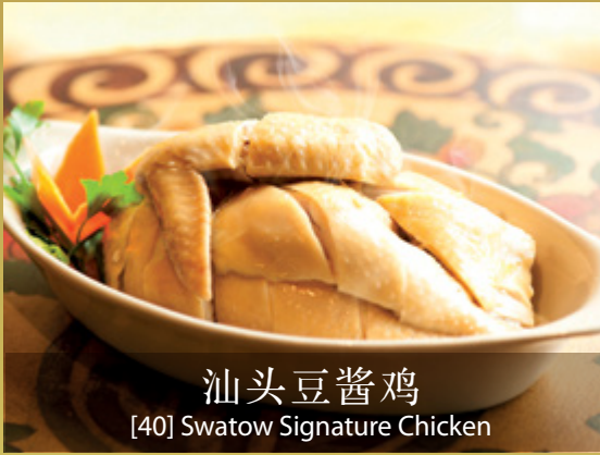
汕头豆酱鸡 [40] Swatow Signature Chicken