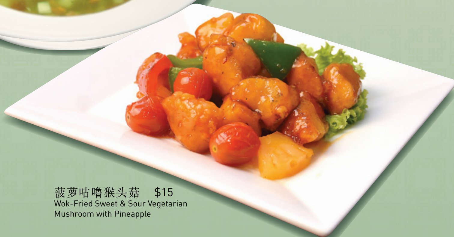
菠萝咕嚕猴头菇 $15 Wok-Fried Sweet & Sour Vegetarian Mushroom with Pineapple