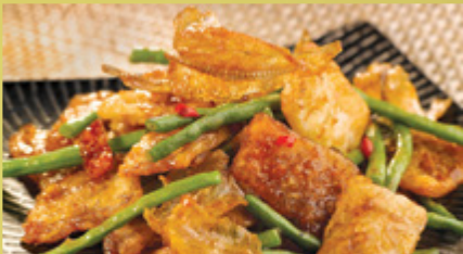
汕头双脆 [507] Crispy Egg Plant with French Bean