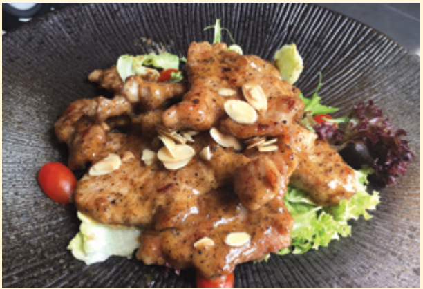
309 芝麻酱煎黑猪肉 Pan-Fried Kurobuta with Tahini Sauce $28