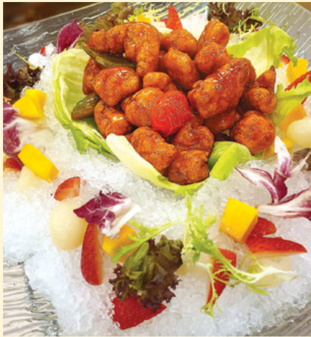
310 冰镇咕嚕黑猪肉 Sweet & Sour Kurobuta Pork $28