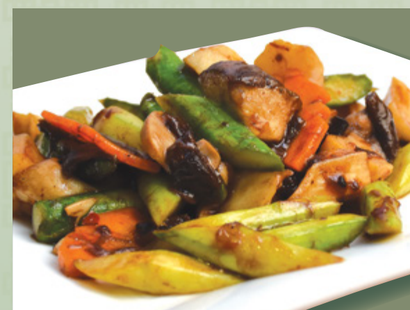
金素X.O.酱芦笋杏鲍菇 $15 Sauteed King Oyster Mushroom in XO Sauce