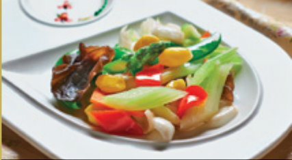
潮州八景 [502] Stir-Fried Teochew Vegetarian Deluxe