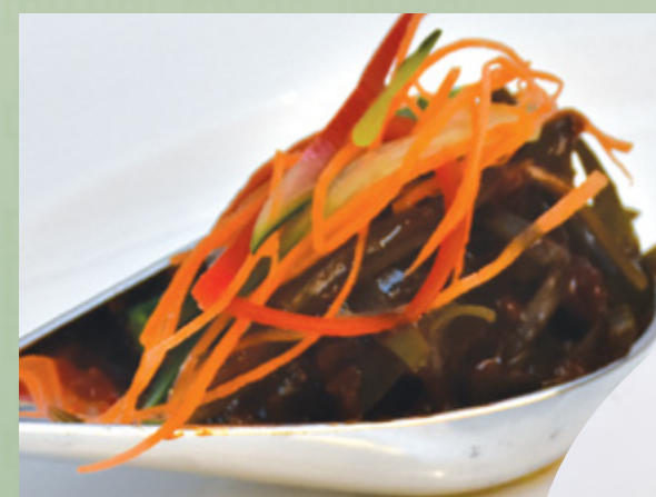
凉拌麻辣海苔丝 $10 Kelp with Mala Cold Dish