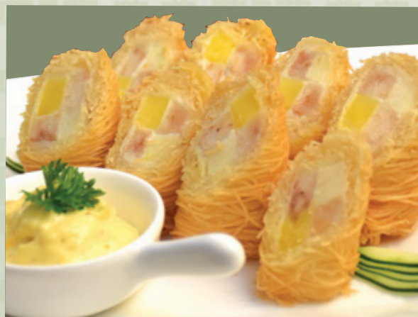
沙律鲜果龙丝卷 $18 /4 件 Crispy Assorted Fruit Salad Roll