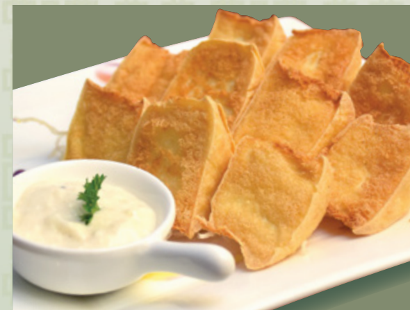
素香普宁炸豆干 $12 “Pu-Ning” Fried Beancurd