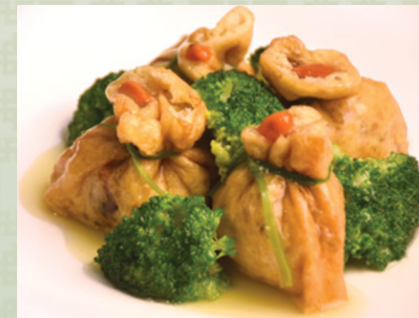
金汁素珍石榴球 $15 /4 件 Steamed Mushroom Wrapped in Egg White in Pumpkin Broth