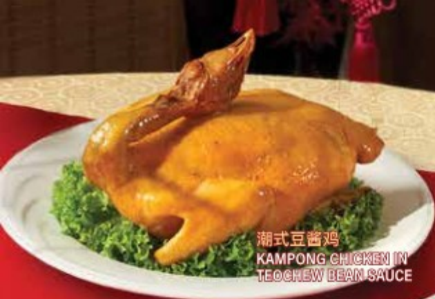
潮式豆酱鸡 KAMPONG CHICKEN IN TEOCHIEW BEAN SAUCE