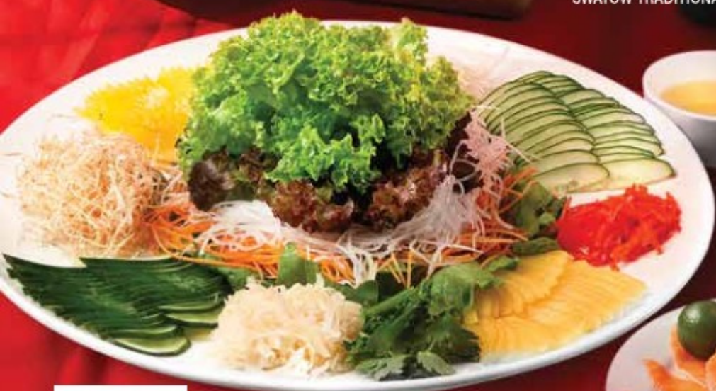
潮式风生水起(熏三文鱼) ASCENDANCE SMOKED SALMON 'YU SHENG'