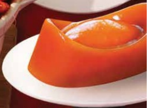
汕头传统年 SWATOW TRADITIONAL 'NIAN GAO'