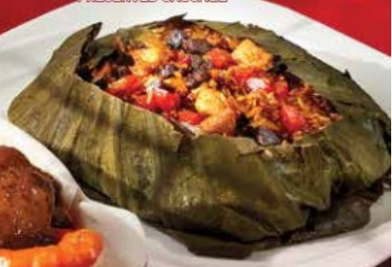
汕头特色腊味饭 FRAGRANT GLUTINOUS RICE WITH PRESERVED SAUSAGE