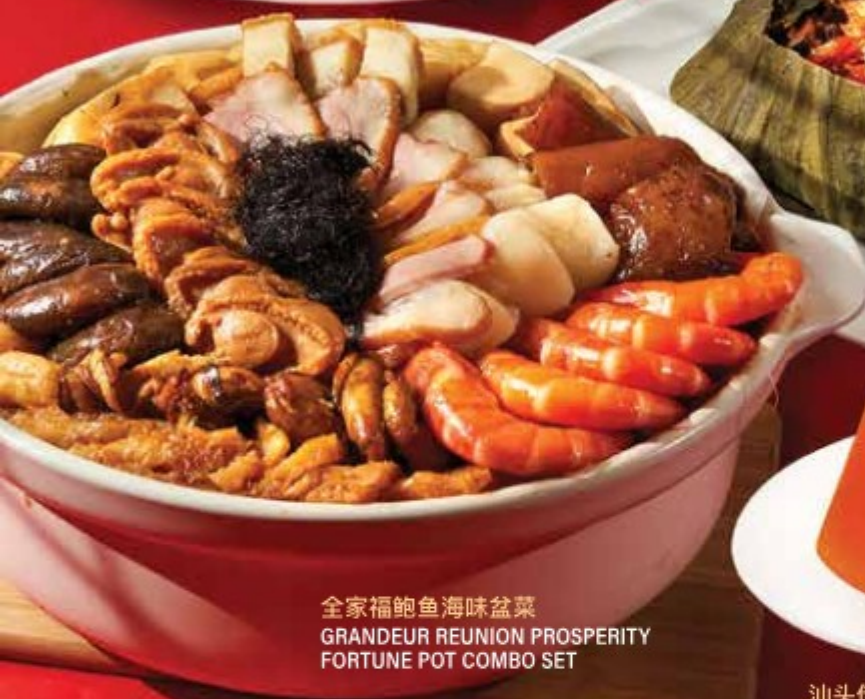
全家福鲍鱼海味盆菜 GRANDEUR REUNION PROSPERITY FORTUNE POT COMBO SET