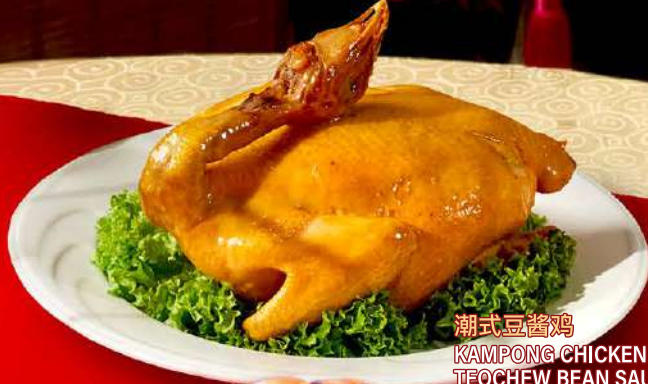
潮式豆酱鸡 KAMPONG CHICKEN IN TEOCHIEW BEAN SAUCE