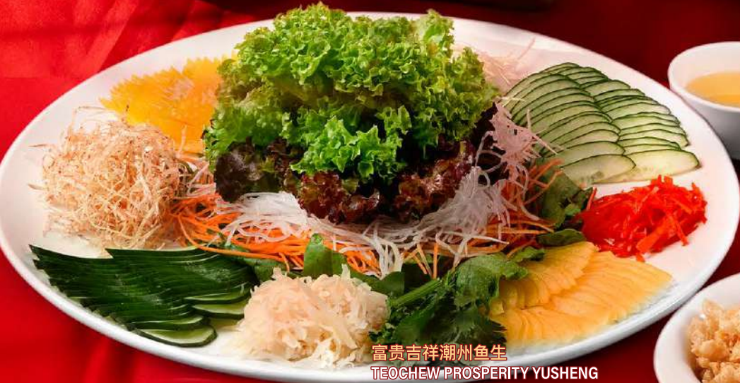
富贵吉祥潮州鱼生 TEOCHIEW PROSPERITY YUSHENG WITH SMOKED SALMON