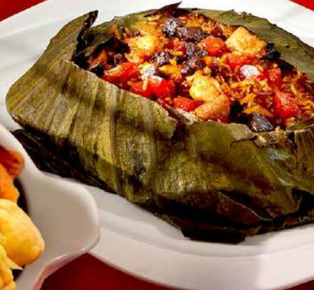
汕头特色腊味饭 FRAGRANT GLUTINOUS RICE WITH PRESERVED SAUSAGE